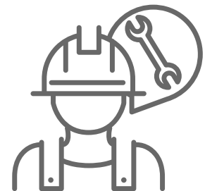
WORKFORCE & ASSET SUPPORT