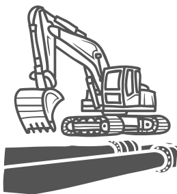
CIVIL & PIPELINE CONSTRUCTION

Topfire's diverse service offering enables us to provide end-to-end project delivery or seamlessly integrate into existing teams. Our track record includes long-term contracts with Glencore, regional councils, and major project proponents, underpinned by industry-certified systems in quality, safety, and environmental management.