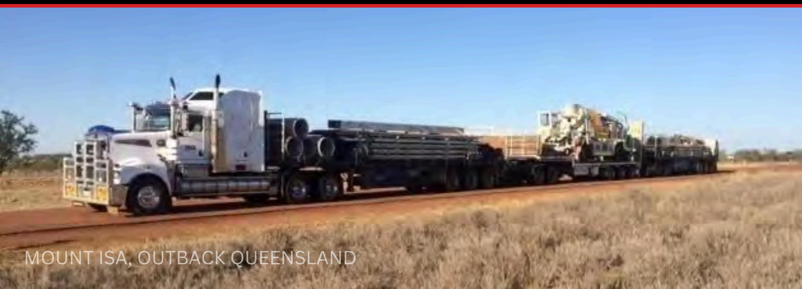
MOUNT ISA, OUTBACK QUEENSLAND

Indigenous Led | Local Expertise | Mining & Government Focus | Award Winning